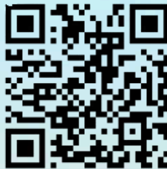
MPDPA Conference 2026