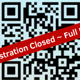
AI Workshop - Pre Conference